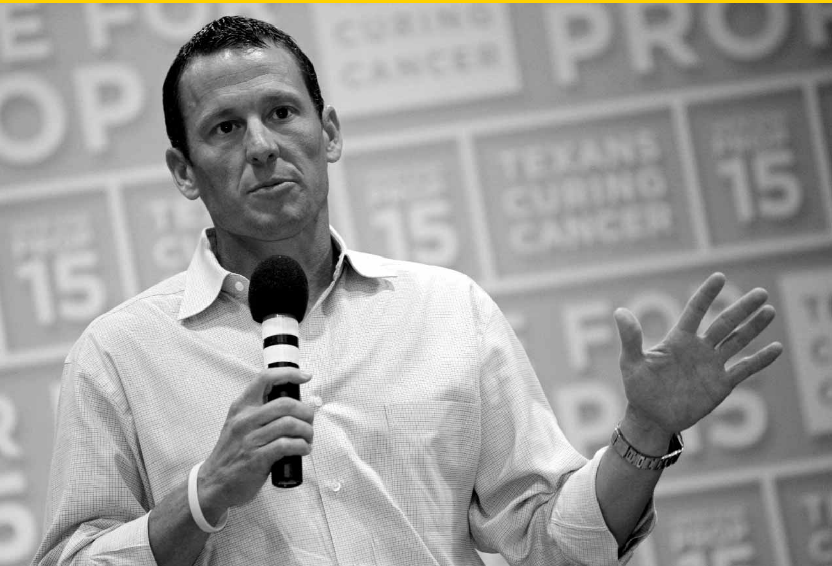
LANCE ARMSTRONG, CANCER SURVIVOR