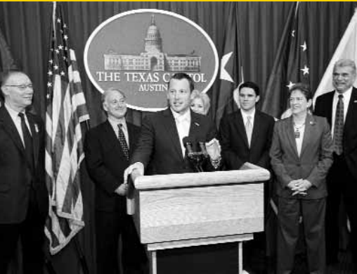
CAPITOL PRESS CONFERENCE

$300 million a year would more than double the current research investment in Texas, representing in a way a 50/50 partnership with the federal government.